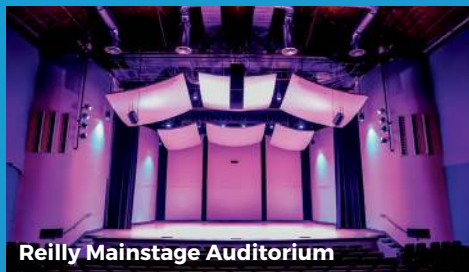
Reilly Mainstage Auditorium

One of our three unique venues is sure to be the perfect space for your next corporate event or family celebration. Each experience offers our highly professional staff, state-of-the-art sound and lighting- all set in the heart of downtown Ocala.