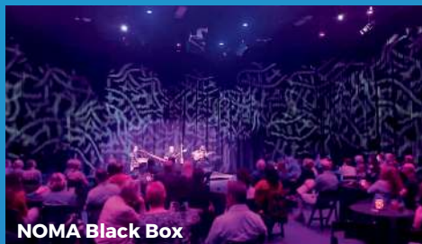
NOMA Black Box